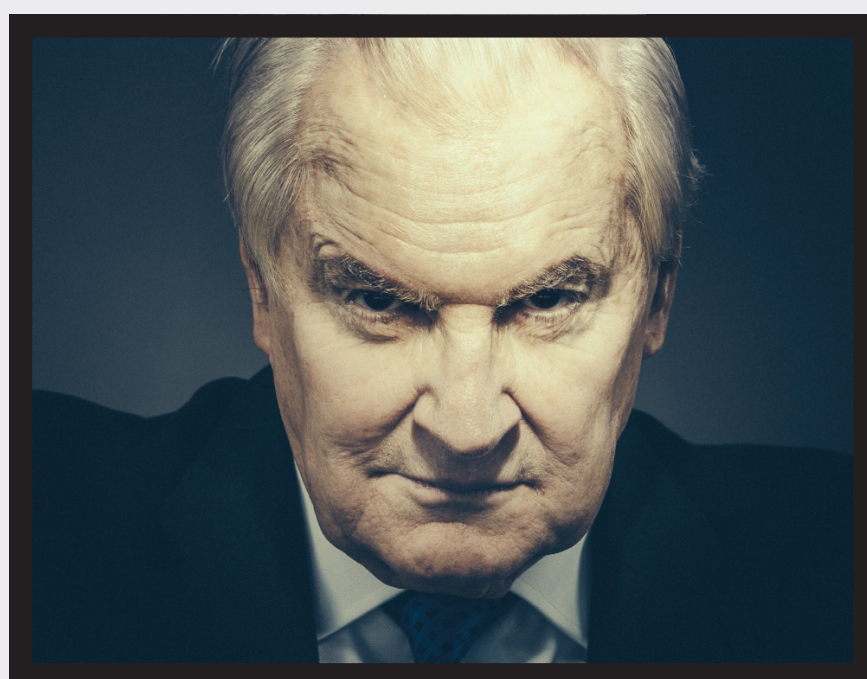
Photography for illustrative purposes only

Who in their right mind would want a woman's boss in charge of her birth control?