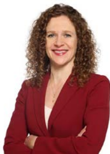
SOPHIE IN 'T VELD, MEP VICE-CHAIR, ALDE CHAIR, PLATFORM FOR SECULARISM IN POLITICS

Sophie in 't Veld is a Dutch Member of the European Parliament for D66, the Dutch social-liberal party, since 2004, and was been re-elected to her third parliamentary term in 2014. Currently she is the Vice-chair of the ALDE Group (Liberals) in the European Parliament and a member of the Civil Liberties, Justice and Home Affairs Committee, of which she is the ALDE spokesperson, and substitute for both the Economic and Monetary Affairs and Gender Equality committees.