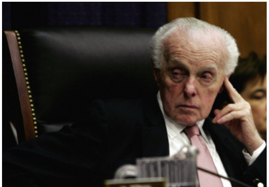
The late Rep. Tom Lantos, a key architect of PEPFAR and supporter of reproductive rights, listens to a testimony during a hearing on Capitol Hill. He passed away on February 11, 2008.